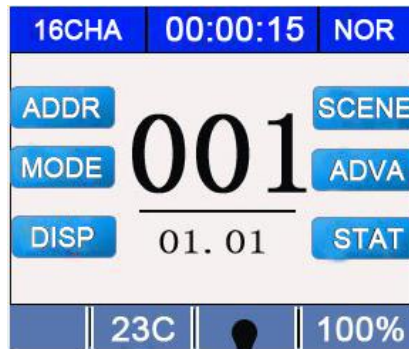
Figure 3 Schematic diagram of display panel